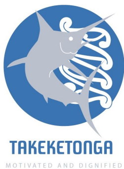
Takeketonga House Leaders