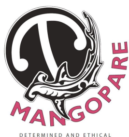
Mangopare House Leaders

The House Leaders and Council Leaders for 2019 were also presented with their badges. Together with the Head Students they make up the Student Executive.