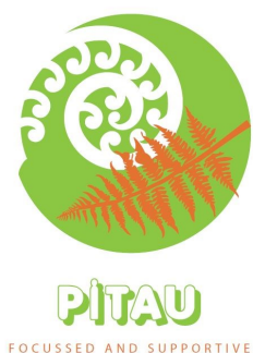
Pitau House Leaders