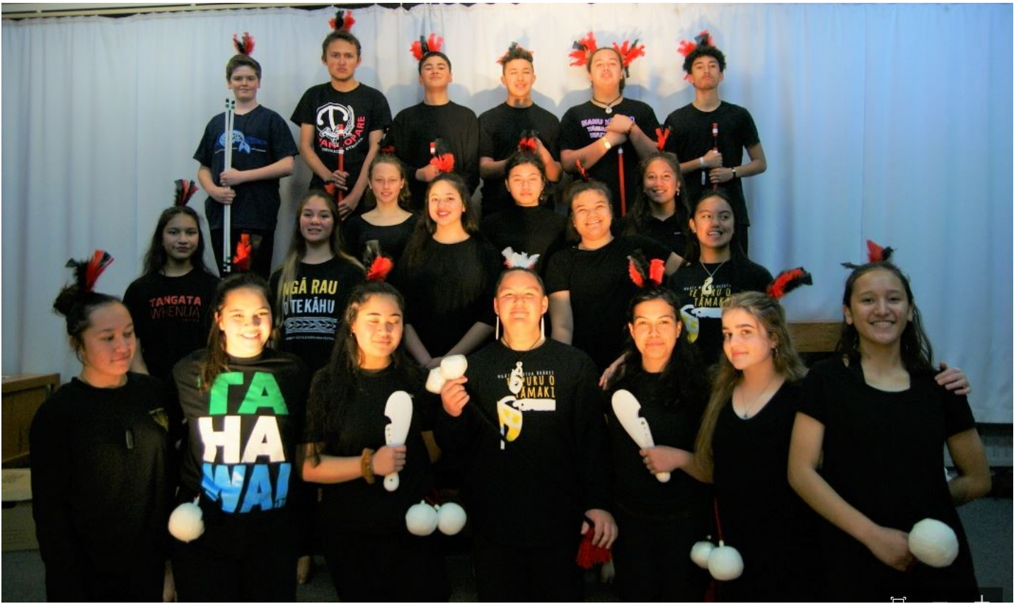
New Zealand Māori