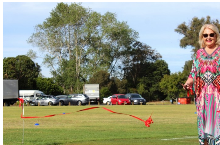
Sheryll Ofner cutting the ribbon to mark the opening of our new grass wicket