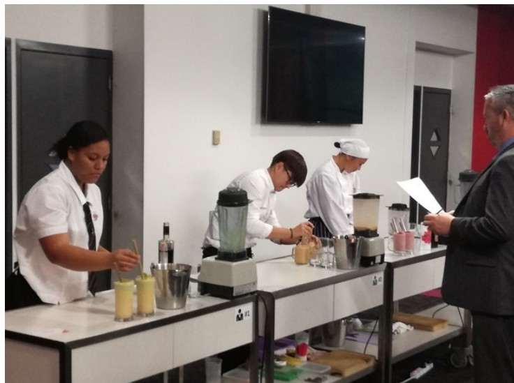
Smoothie Making - Chai-Mi Nutty Mango & Avocado Smoothie and a Chai Banana & Carrot Smoothie