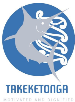
Takeketonga House Leaders