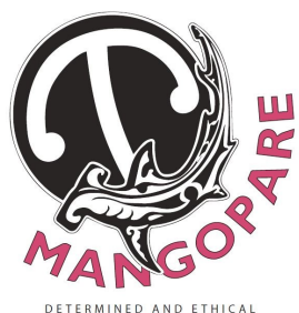
Mangopare House Leaders

Huge congratulations to these fabulous Selwyn students who have been selected leaders and members of our Student Executive for 2020.