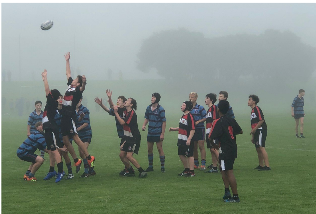
Selwyn's Junior Boys Rugby Team playing hard

Watch this space for more exciting sports news!