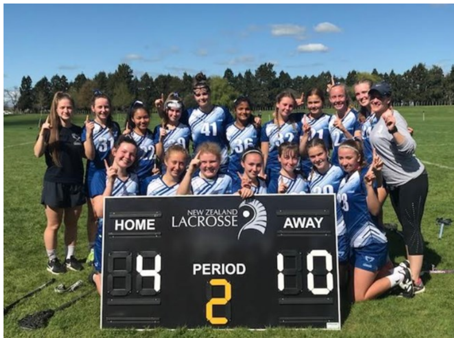
Georgia's Auckland Blue Team